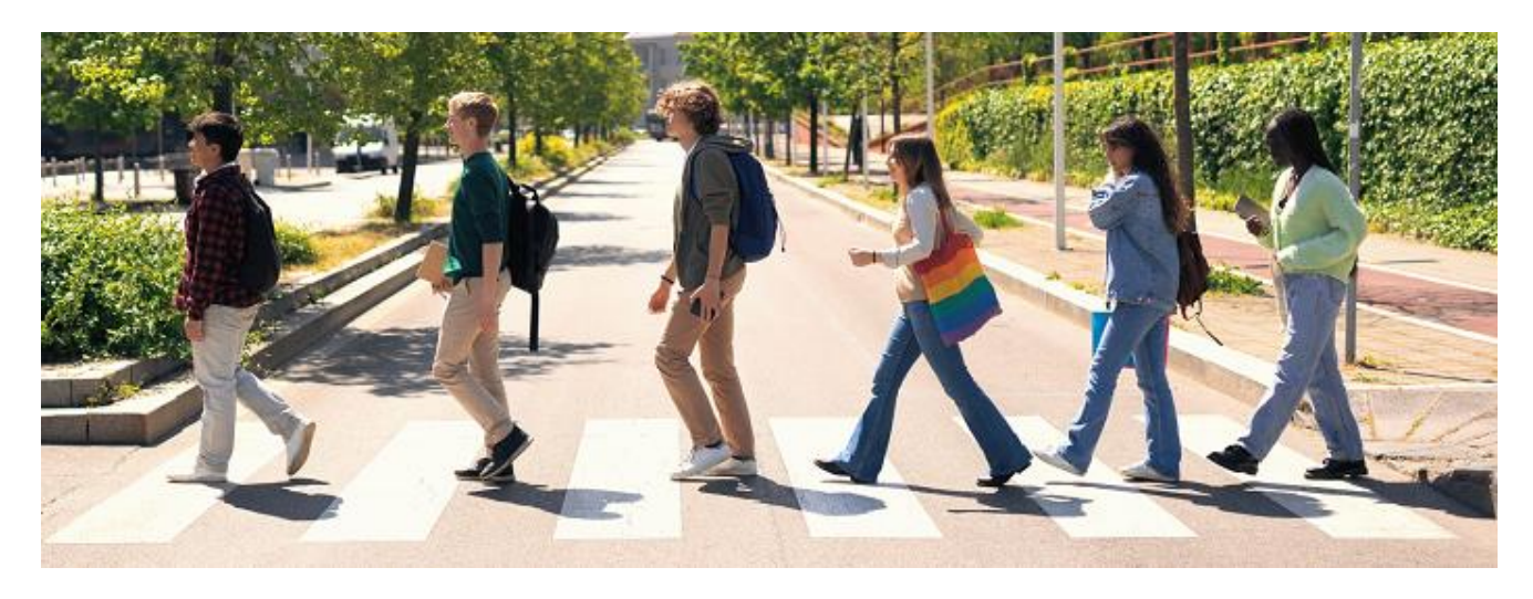
Alle info, tot en met teksten en PowerPoint voor de scholen zijn beschikbaar op: www.lions-quest.be/scholen-voor-goede-doelen.html